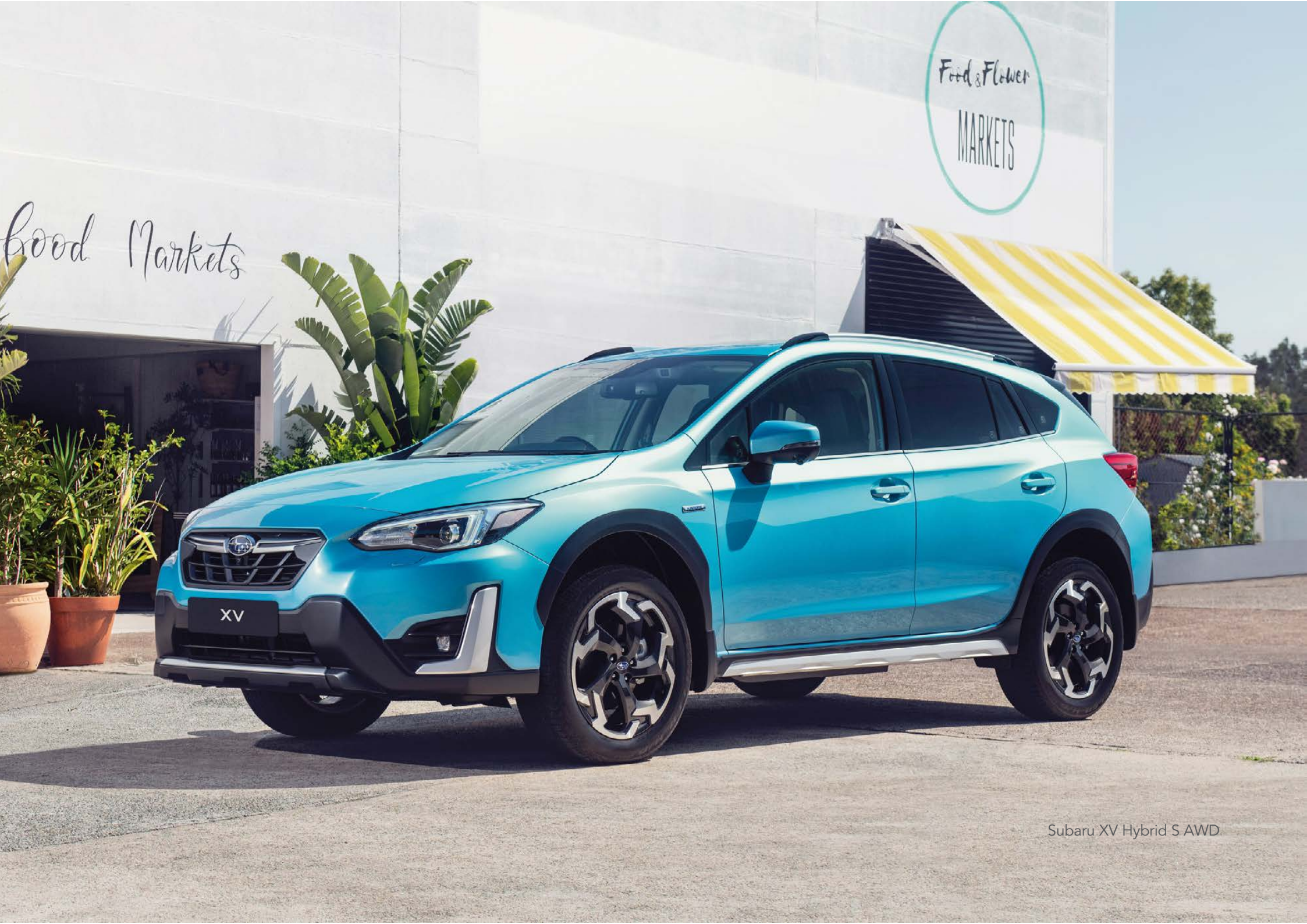
Subaru XV Hybrid S AWD